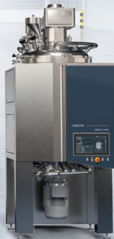
UNIMIX 1000 S